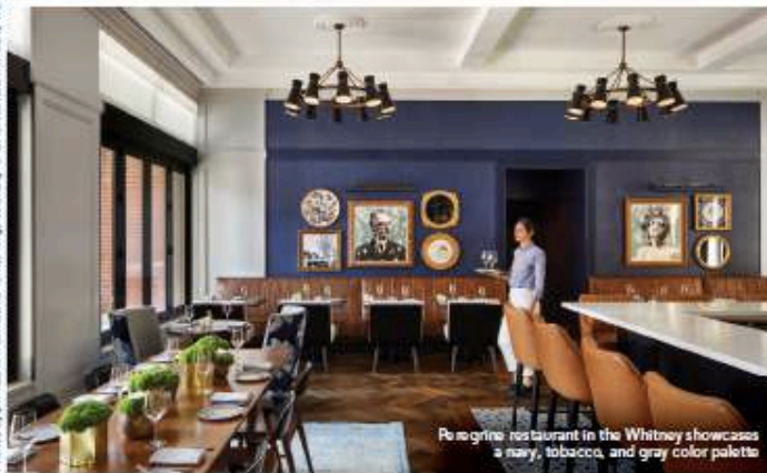
Peregrine restaurant in the Whitney showcases a navy, tobacco, and gray color palette

Photos by JAMES BAIGRIE and renderings courtesy of STONEHILL TAYLOR, ROCKWELL GROUP, and THE ARCHITECTURAL TEAM