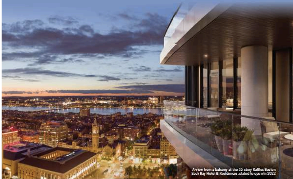
A view from a balcony at the 35-story Raffles Boston Back Bay Hotel & Residences, slated to open in 2022

Residing in the tony Beacon Hill neighborhood, the 87-room hotel, recently honored by the Boston Preservation Alliance, melds a 1908-era former nurses' residence with a red brick addition, courtesy of Haetrn + Associates, whose curving facade wraps what was a long-vacant corner of Charles and Cambridge streets. Public spaces include a courtyard garden that