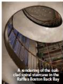
A rendering of the oak-clad spiral staircase in the Raffles Boston Back Bay