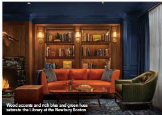
Wood accents and rich blue and green hues saturate the Library at the Newbury Boston