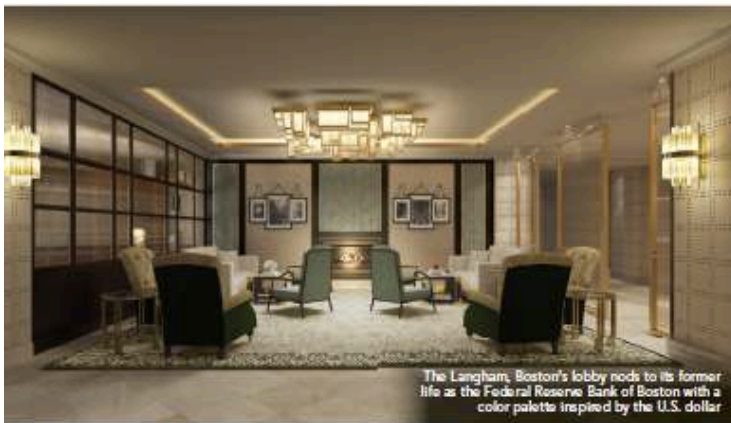
The Langham, Boston's lobby nods to its former life as the Federal Reserve Bank of Boston with a color palette inspired by the U.S. dollar