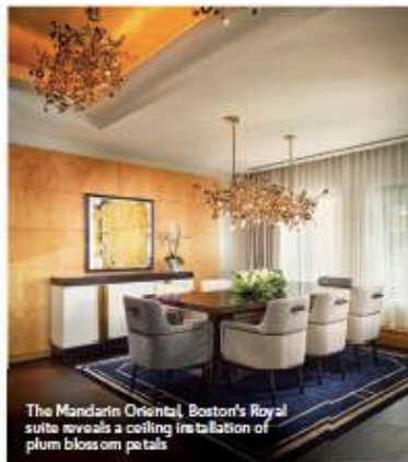
The Mandarin Oriental, Boston's Royal suite reveals a ceiling installation of plum blossom petals