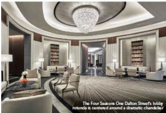
The Four Seasons One Dalton Street's lobby rotunda is centered around a dramatic chandelier