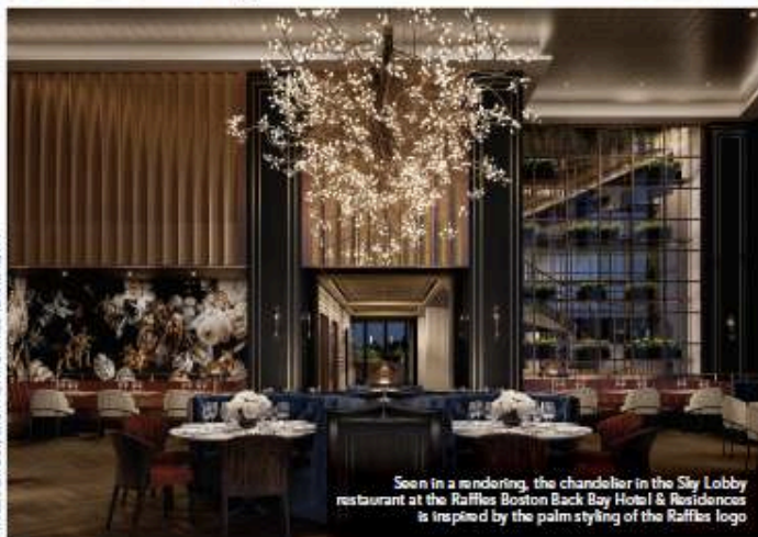
Seen in a rendering, the chandelier in the Sky Lobby restaurant at the Raffles Boston Back Bay Hotel & Residences is inspired by the palm styling of the Raffles logo